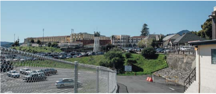
CA State Prison at San Quentin, CA

In 2004, veterans of the Iraq-Afghanistan eras comprised only 4% of veterans in both state and federal prison. For this particular demographic, the average length of military service was approximately four years. Veterans reportedly had shorter criminal records than non-veterans in state prison, yet they had longer prison sentences. Only 62% of incarcerated veterans were honorably discharged from the military in 2004. Veterans (57%) were more commonly serving time for violent offenses than their non-veteran counterparts (47%.) Additionally, they were more likely to be incarcerated for homicide (15%) and sexual assault (23%) than non-veterans (12% and 9%, respectively.) Due to the violent nature of many of the crimes committed by incarcerated veterans, more than a third of veterans in state prison had maximum sentences of at least 20 years, life, or a death sentence.