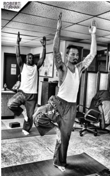
Students at CA State Prison (SQ)

Combat trauma narratives are much more than words on a page: they are stories rooted deeply in the body. With each iteration of a veterans' story, new details are uncovered and, with them, the terrifying emotions that accompanied the original event. Dr. Bessel van der Kolk, pioneering researcher in the field of trauma, says "the memory of trauma is imprinted on the human organism. I don't think you can overcome it unless you learn to have a friendly relationship with your body." Through a partnership with Prison Yoga Project, VHV-FTIO members have the opportunity to participate in yoga and meditation practices which are specifically geared for trauma survivors. Trauma-sensitive yoga and meditation allow members to process their work in the group at a physical level, releasing long-lived tensions and memories held in the body.